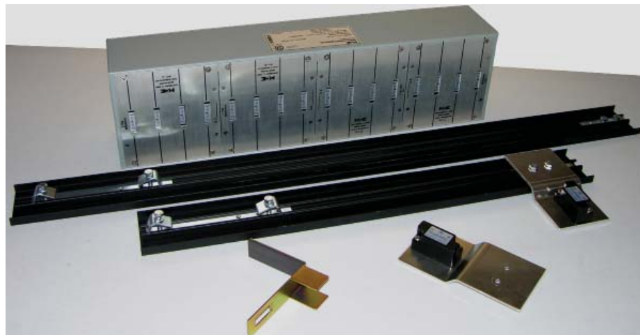
TLS-C-G2 components and alignment tool

The sturdy, cartop-mounted steel enclosure protects switch electronics. The enclosure is available in 12- and 16-switch capacities to suit the requirements of the majority of installations. Individual switches are positioned on 1 5/8 inch (41.1 mm) centers.